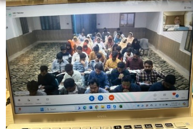
International Bible Institute online and classroom