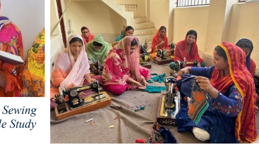
Gypsy Women Sewing Class and Bible Study